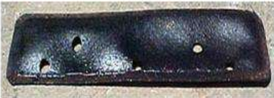
large area neoprene/cork material supplied from clubs tends to distort badly